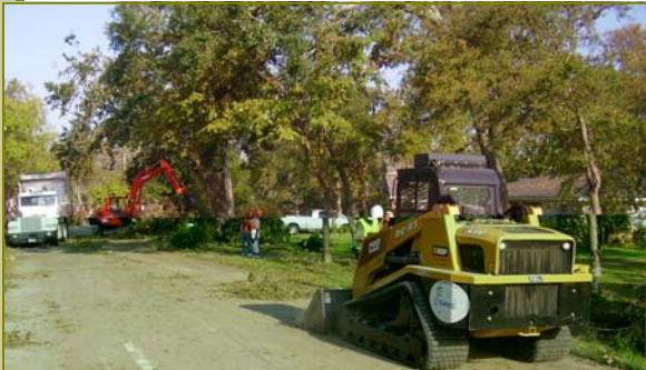
Hurricane IKE Disaster Relief