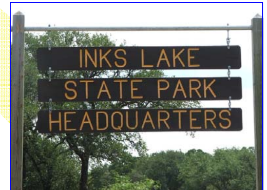
Parking Lot Project Completed at Inks Lake